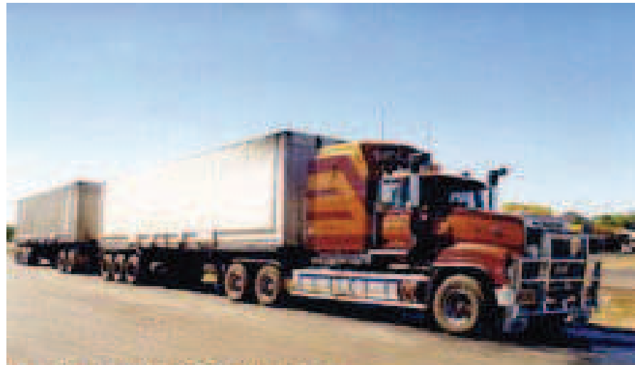
17-Point Tractor & Trailer Inspection